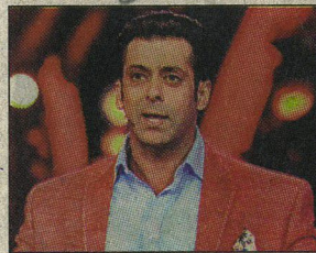
■ Salman Khan

DJOKER TRUMPS RAFA AT ATP FINALS SERB DEFENDS TITLE, WINNING STREAK NOW AT 22 >HT SPORT P18